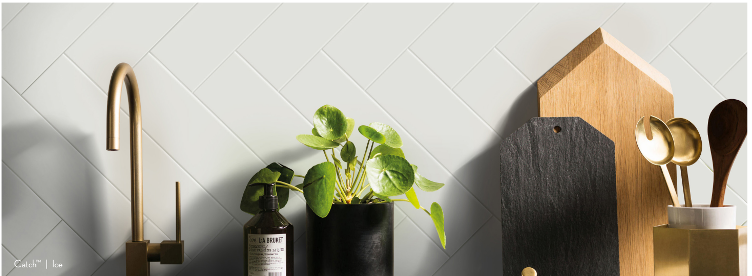
Catch™ | Ice

All Colors Available in Matte & Gloss Finish 6"x6" Available in Ice Gloss Only