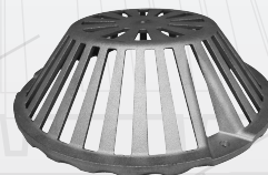
Low profile aluminum strainer

Above drains were able to perform at the peak rates with a head of water of 3-1/4" or less.