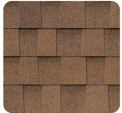
Desert Shake IR