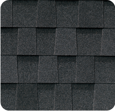
Black Shadow IR