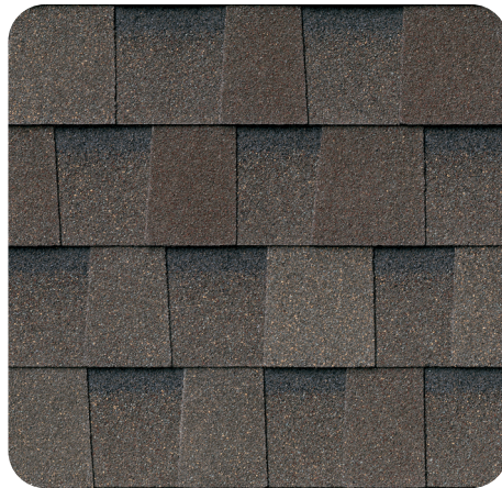
Weathered Wood IR