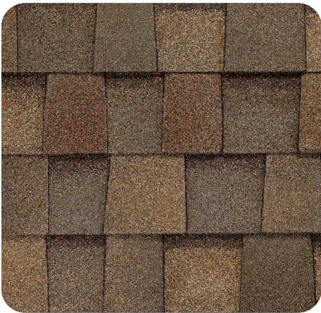
Cool Coral Canyon