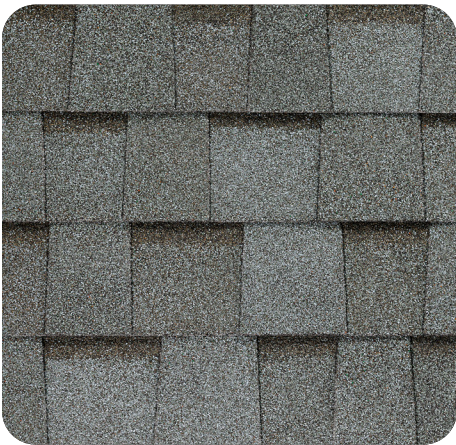
Cool Coastal Cliffs