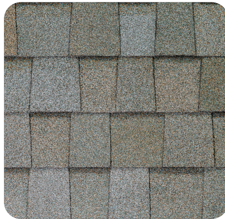
Cool Moonlight Beach