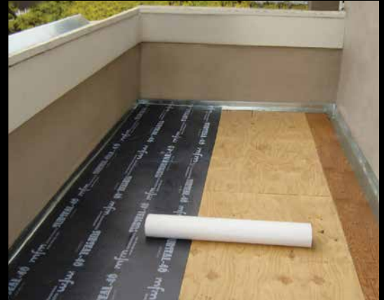
SubSeal is an excellent choice for waterproofing balcony decks and other surfaces that will be finished with concrete.

Call one of our professionals today at 800-882-7663 to get your project on the right track.