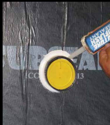
Applying sealant at all pipe terminations is an excellent way to complete a proper waterproofing job.