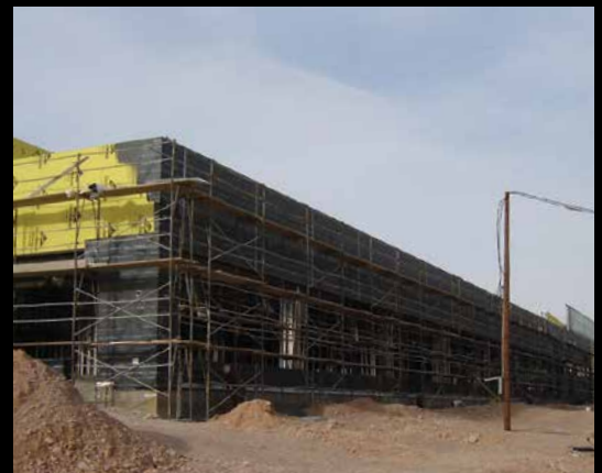
SubSeal offers high strength, high elongation and is flexible to accommodate expansion and contraction of the substrates.