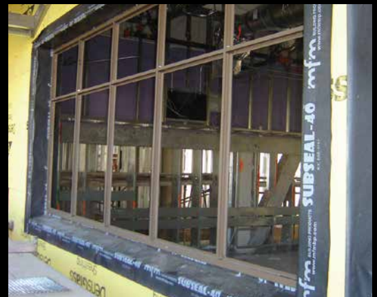
SubSeal bonds aggressively to poured concrete and other building materials. It is fully adhered to the substrate to eliminate movement of water under the membrane.