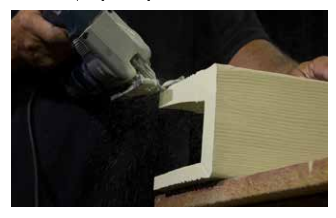
Step 12 - Rotate the beam so the open end is sitting flat on a work surface. Start cutting the bottom of the beam at a slight angle until you can get a straight 45° angle.