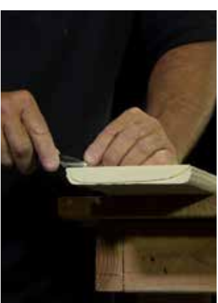
Step 11 – Now miter the beam to accept the end cap. With the open side facing you and using the same miter angle as the beam end cap, begin cutting the beam side.