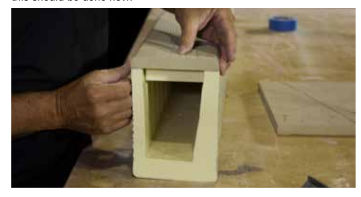
Step 5 - After beam and beam top have been cut, tape in several places along the length of the beam or clamp beam top to the open beam.

Note : If any minor trimming is required on either beam or beam top, this should be done now.