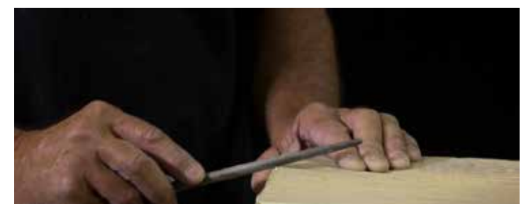
Again, fit beam end cap to beam and beam top and continue to sand as needed for final fit.

( Note : Once you are satisfied with your final fit, file the edges of the beam end cap to flow seamlessly into the beam and beam top).