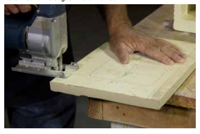
Step 9 – After the beam end cap has been cut, move the jigsaw bevel gage to a 45° angle. You are going to miter cut the beam end cap with grain side up (make sure the miter is placed at the correct angle). Begin cutting by following the grain profile, using the painted edge as your guide