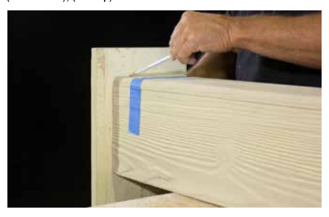
Step 8 – Using the jigsaw, cut beam end cap along the marked line on the smooth side of the beam end cap.

Note: Designate the beam end cap as top and bottom with marks (B - bottom), (T - top).