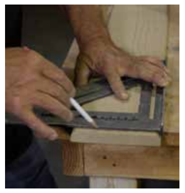
Step 2 - Square beam using small cut blocks of polyurethane or other material along the length of the beam. This will ensure proper alignment of the beam top.