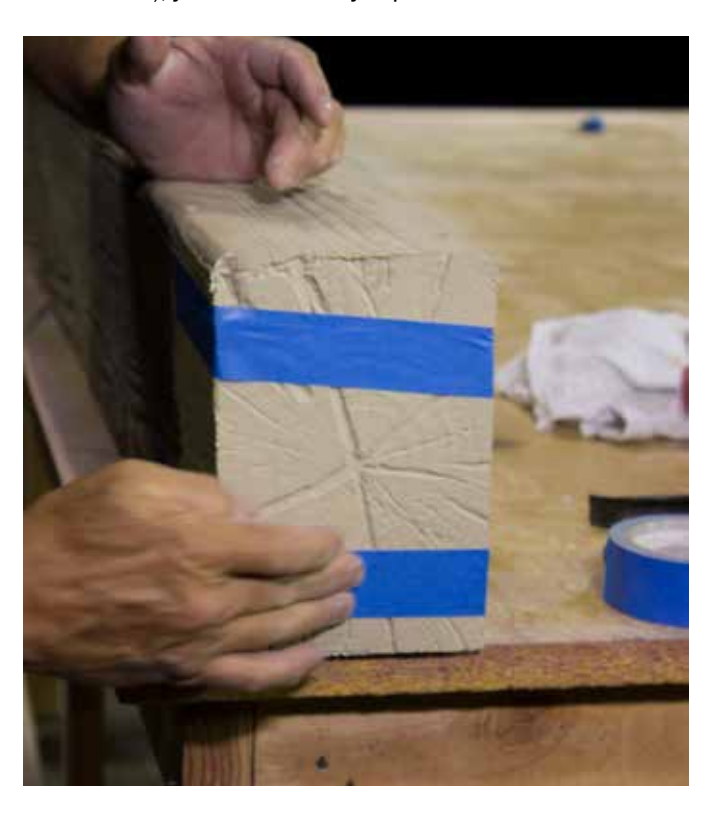
Tip : If desired, after the adhesive dries, you can also use a finish nail gun to ensure beam end and beam top are secured (use small finishing nails with proper PSI settings based on the nail gun used).