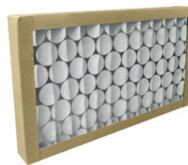
ACCESSORY 62-901F OUTER FILTER 9-1/2" X 16-1/2" SEP PLEATED, 5 MICRON