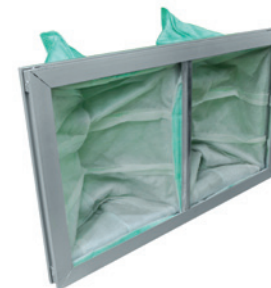
ACCESSORY 62-902F INNER FILTER BAG 9-1/2" X 16-1/2", 1 MICRON