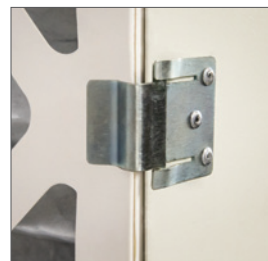
QUICK LATCH SYSTEM FOR CHANGING FILTERS