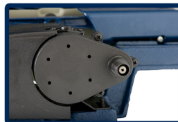
Connection for Flex Shaft