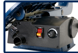
Safety ON/OFF Switch and Variable Speed Knob