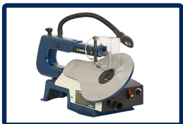
Table Tilts 0° to 45°