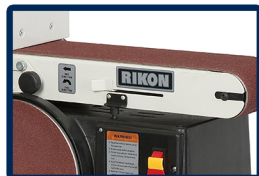
Belt Tension Quick Release Handle