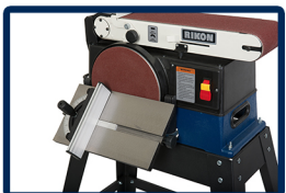
Cast Iron Table Tilts from 0° - 45° Miter Gauge Included