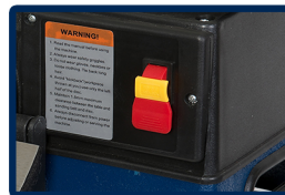
Safety Push Button ON/OFF Switch