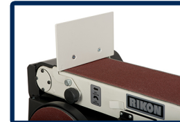
Work Support Table Included