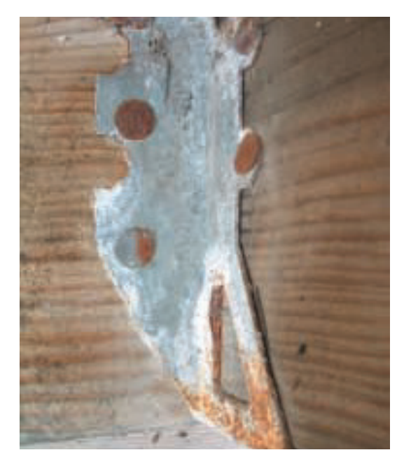
Galvanized joist hanger attached to ACQ wood, 7 months; wet conditions.

Good news for the environment is bad news for decks. New wood preservatives cause accelerated corrosion.