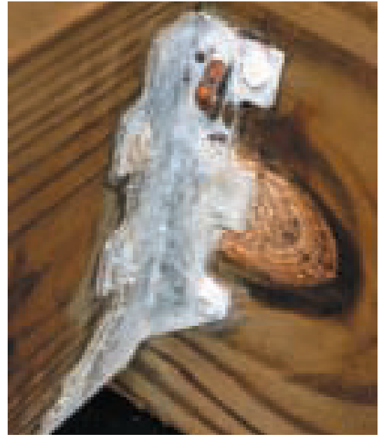
Galvanized joist hanger attached to ACQ wood, 7 months; wet conditions.