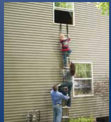
Supports up to 1,200 pounds