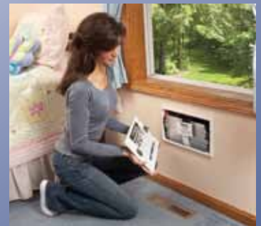
Always there, blends with decor