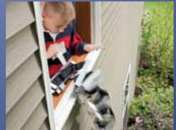
Deploys in seconds, easy to use